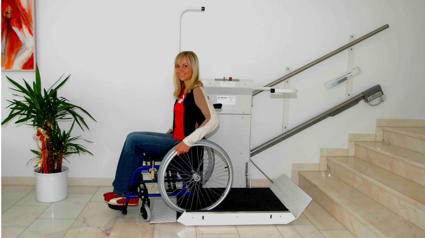
An elegant and modern Lift that fits smoothly into any environment